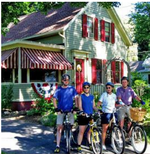
Guests at Sugar Maple Trailside Inn

1 of 3 railroad bridges I have owned in Massachusetts thru my Central Highlands Conservancy, LLC.